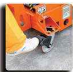
Castor With Brake