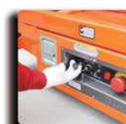
Emergency Lowering System