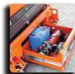
Slide Out Tray