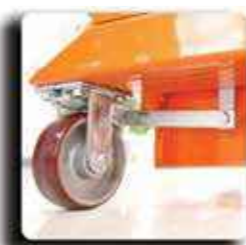
Automatic Brake System-Option