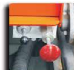
Brake Release Valve