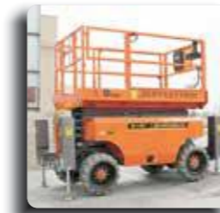
Automatic Leveling Outriggers