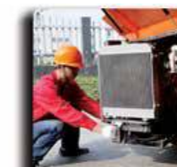
Swing-out Engine Tray