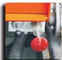
Brake Release Valve