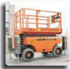
Automatic Leveling Outriggers