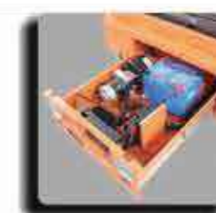
Slide Out Tray