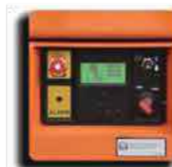
Touch Display Screen