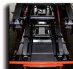
Fully Protected Chassis