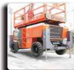
Automatic Leveling Outriggers