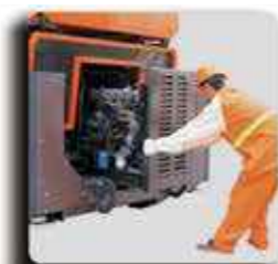
Slide-Out Engine Tray