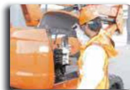
Manual Safety Pump