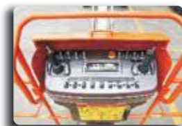
Waterproof Platform Control