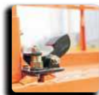
Platform Extension Footlock