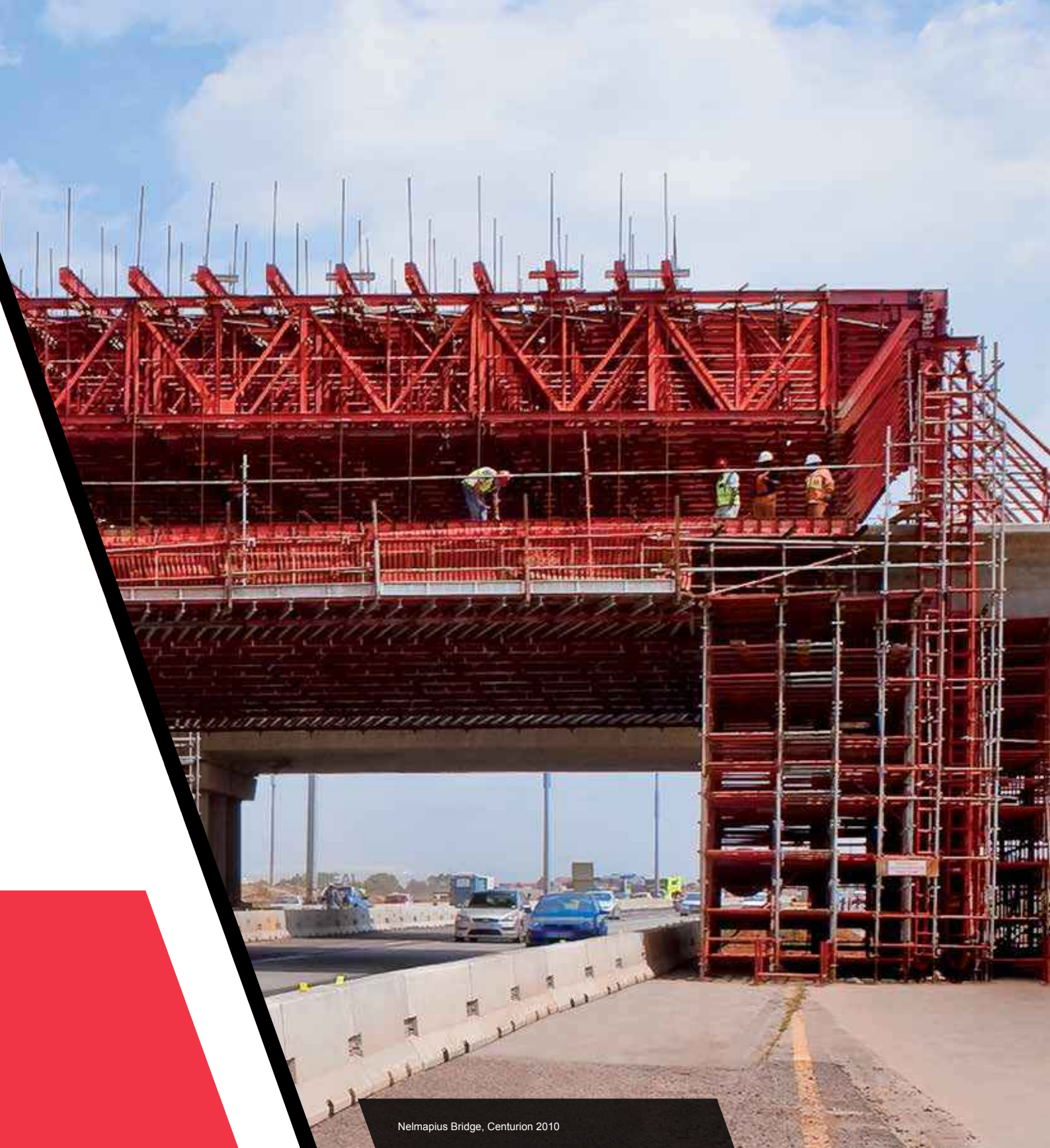
Nelmapius Bridge, Centurion 2010

Established in 1963, Form-Scaff is a leading supplier of formwork and scaffolding to the construction and civil engineering industries. The company not only manufactures, hires and sells world-class products, but also provides design skills, technical advice and support. With over 35 branches nationwide, the company enjoys a growing footprint across the globe as well as a burgeoning international export market.