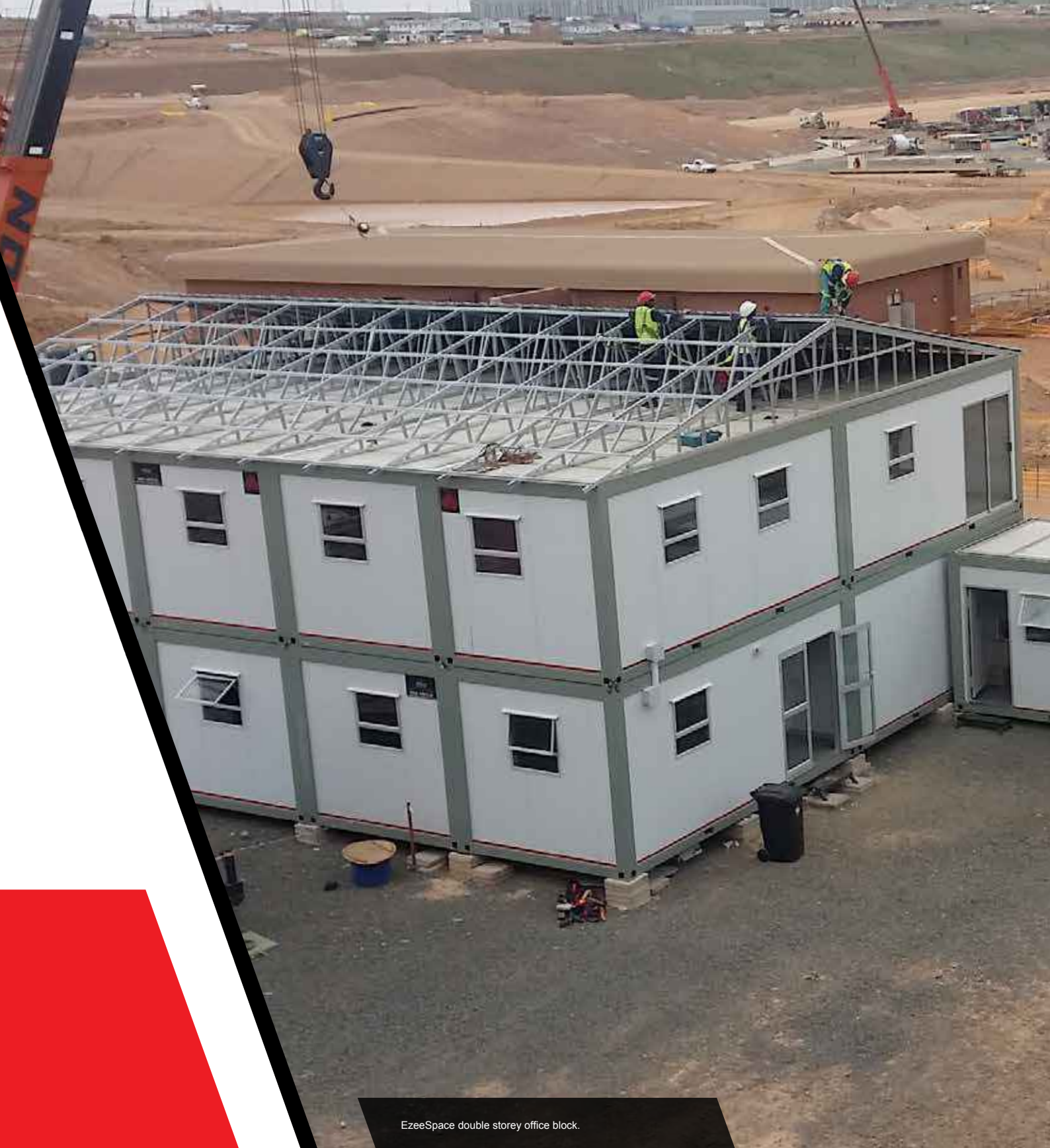
EzeeSpace double storey office block.