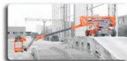
Under Ground Reach