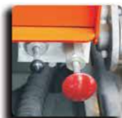
Brake Release Valve