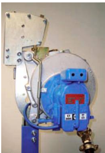
Alpha Air with Sky Grip (option)