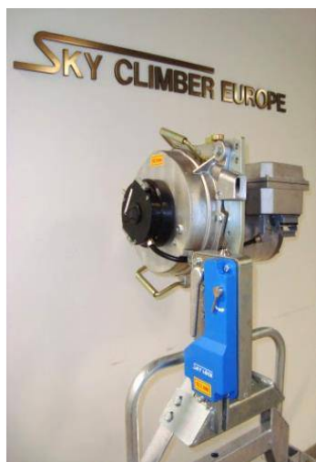
Alpha 1000 with stirrup mounted Sky Lock (recommended) (option)

Whether you need to reach new heights or fit into tight places, or both, turn to SKY CLIMBER ®. The ALPHA hoist from SKY CLIMBER ® is part of the innovative family of specialized suspended platforms hoists.