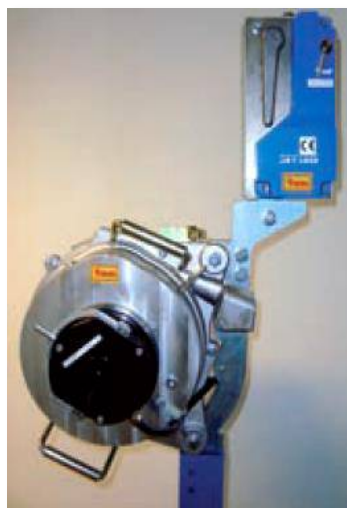
Alpha 800 with hoist mounted Sky Lock (option)