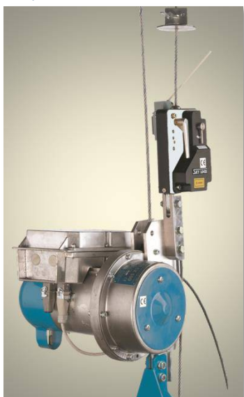
CX 500 with Sky Lock

Whether you need to reach, new heights or fit into tight places, or both, turn to SKY CLIMBER ®. The COMPACT and CX 500 hoists from SKY CLIMBER ® are part of the innovative family of specialized suspended platform hoists.