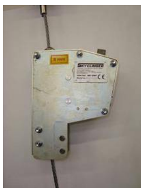
Sky Grip 8 mm