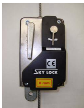
Sky Lock III 8 mm

Although designed to be used with SKY CLIMBER hoists, the Sky Lock III has found other uses as an independent safety device. On oil drilling rigs it is used with derrick climbers as a descent control device and on special purpose elevators as a brake. Requiring no external power source, the Sky Lock III is available for additional special applications.