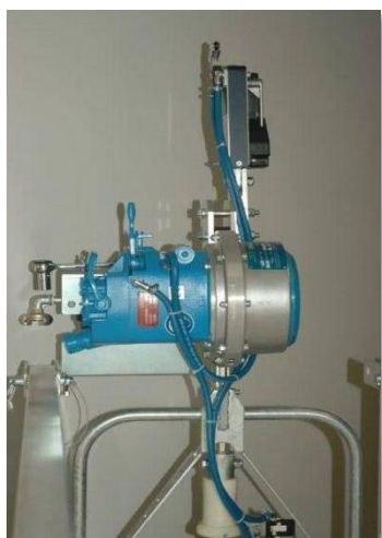
CX 500 pneumatic hoist with Sky Lock