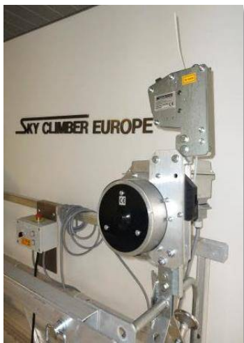
COMPACT with Sky Grip (CE)