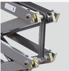
Touch Display Screen

Mini scissor lifts series uses the battery as the power source. The maximum working height covers 5.9-7.6m and the maximum load is 240kg. The whole machine is compact and flexible, small in size, light in weight, and can enter and exit the elevator at will. It is specially designed for building interlayer aerial working.