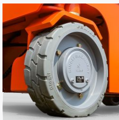
Non Marking Tyre