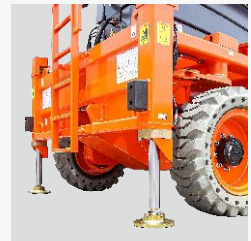
Automatic Leveling Outriggers