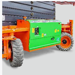
4WD&4WS (Apply to JCPT3214/JCPT2814 JCPT2223/JCPT2212)