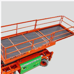
One-key Extended Platform (Apply to JCPT2223)

In addition to all the advantages of engine drive types, in view of the pure electric design, the electric drive rough-terrain scissor lift series also takes into account the environmental advantages of noiseless, zero emission and so on. It is suitable for the operation environment with high environmental requirements, such as SGCC, nuclear power plant, SINOPEC, CNPC, residential area, airport, tunnel, etc.